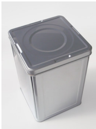
A standard 18 liter storage can (Itto-kan - Itto-kan)